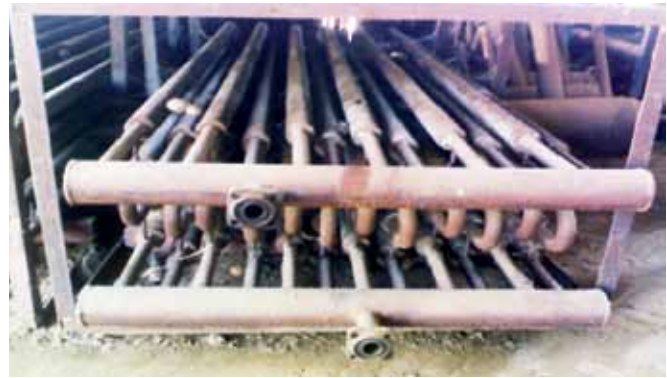
Figure 2: Ceiling suspended coils (bunker coils)

In case air coolers are used, normally 4 air coolers each of 9-10 TR capacity are used for each cold room storing 1250-1500 ton potatoes; each cooler has an approximate surface area of 2270 sq ft comprising of 191.5 sq ft bare tube area and 2078.5 sq ft fin