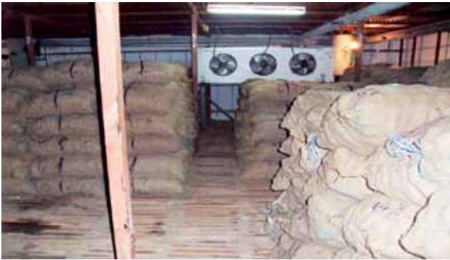
Figure 1: Air coolers (fan coil evaporators)

Air coolers or unit coolers consist of compact and highly efficient coils enclosed in housings with fans that draw the room air or warm return air through the coil at high velocities. In the process, the air is cooled and the low temperature refrigerant inside the coil evaporates.